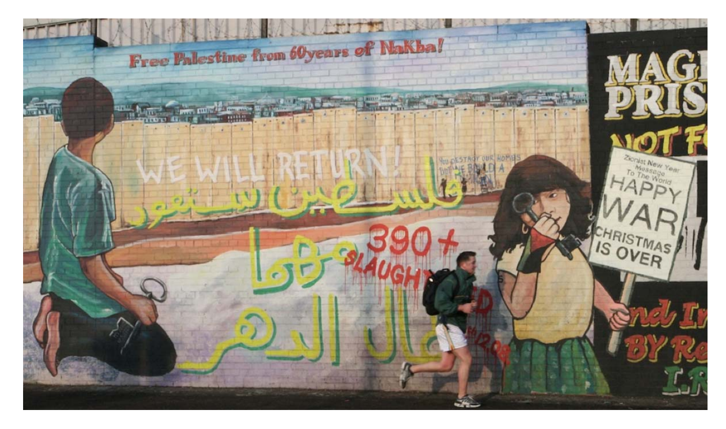
Painting image on Fall's Road, Belfast (Ireland)